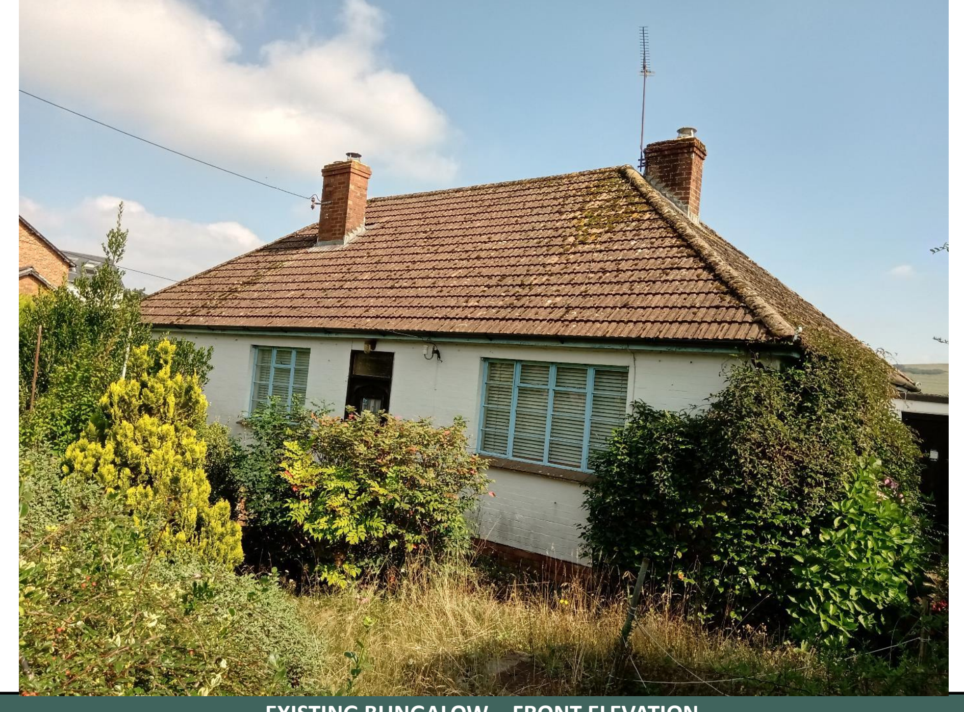
EXISTING BUNGALOW – FRONT ELEVATION