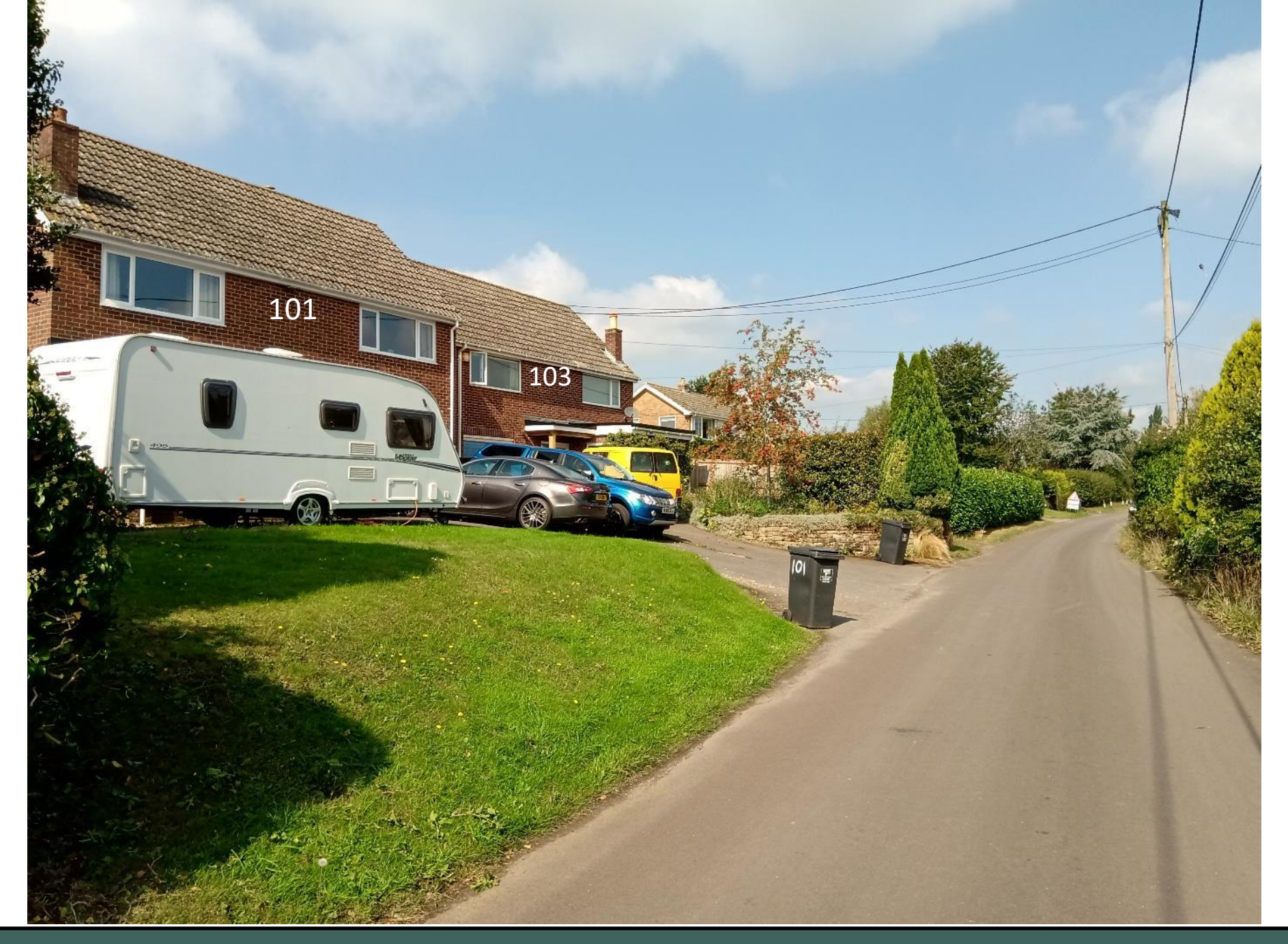
OPPOSITE PAIR OF PROPERTIES – 101 & 103