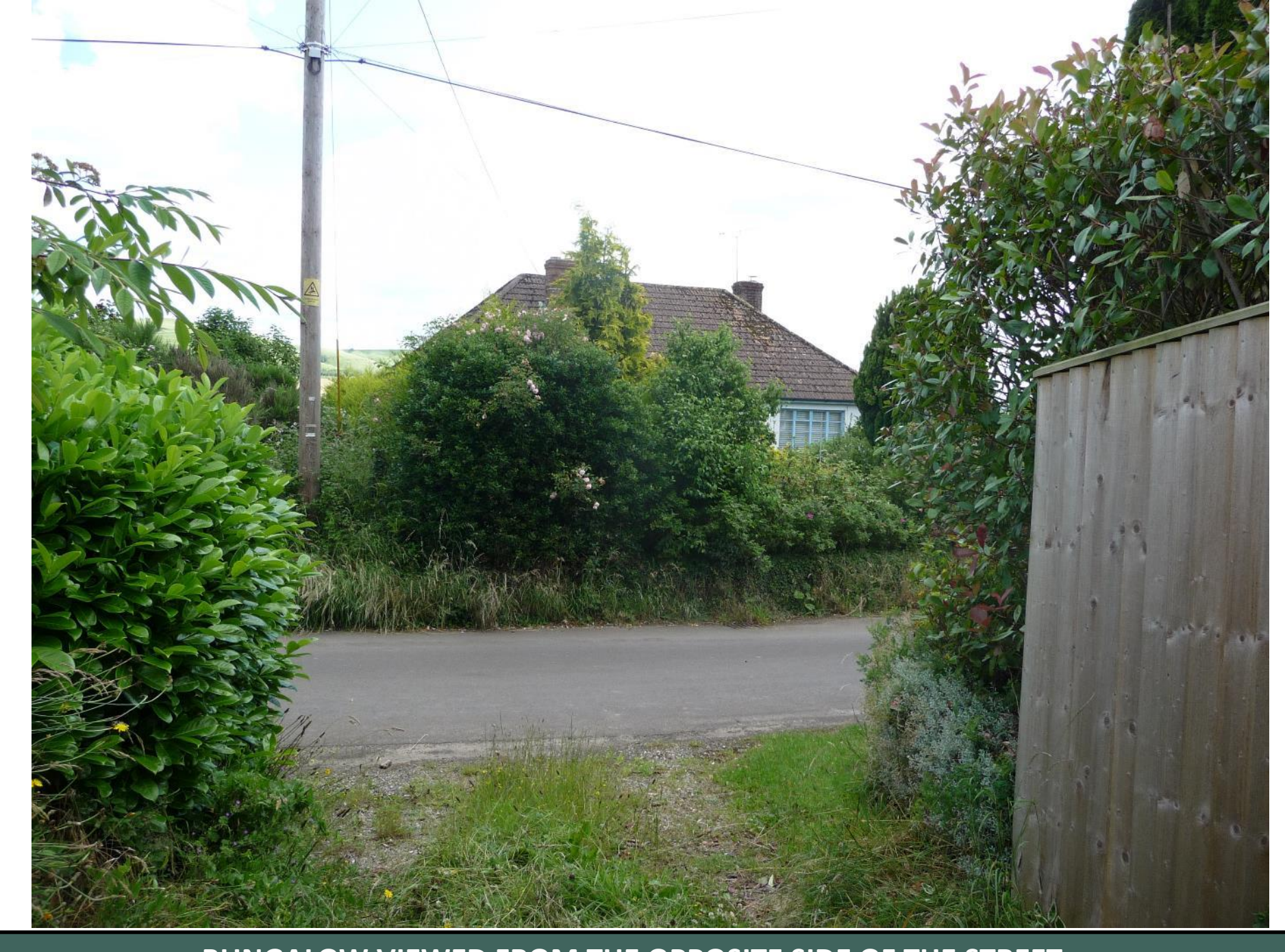
BUNGALOW VIEWED FROM THE OPPOSITE SIDE OF THE STREET