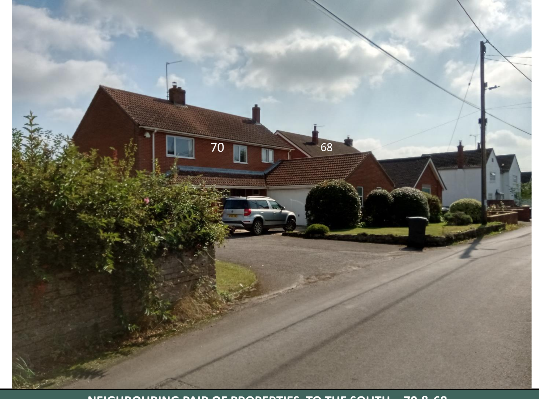
NEIGHBOURING PAIR OF PROPERTIES TO THE SOUTH – 70 & 68